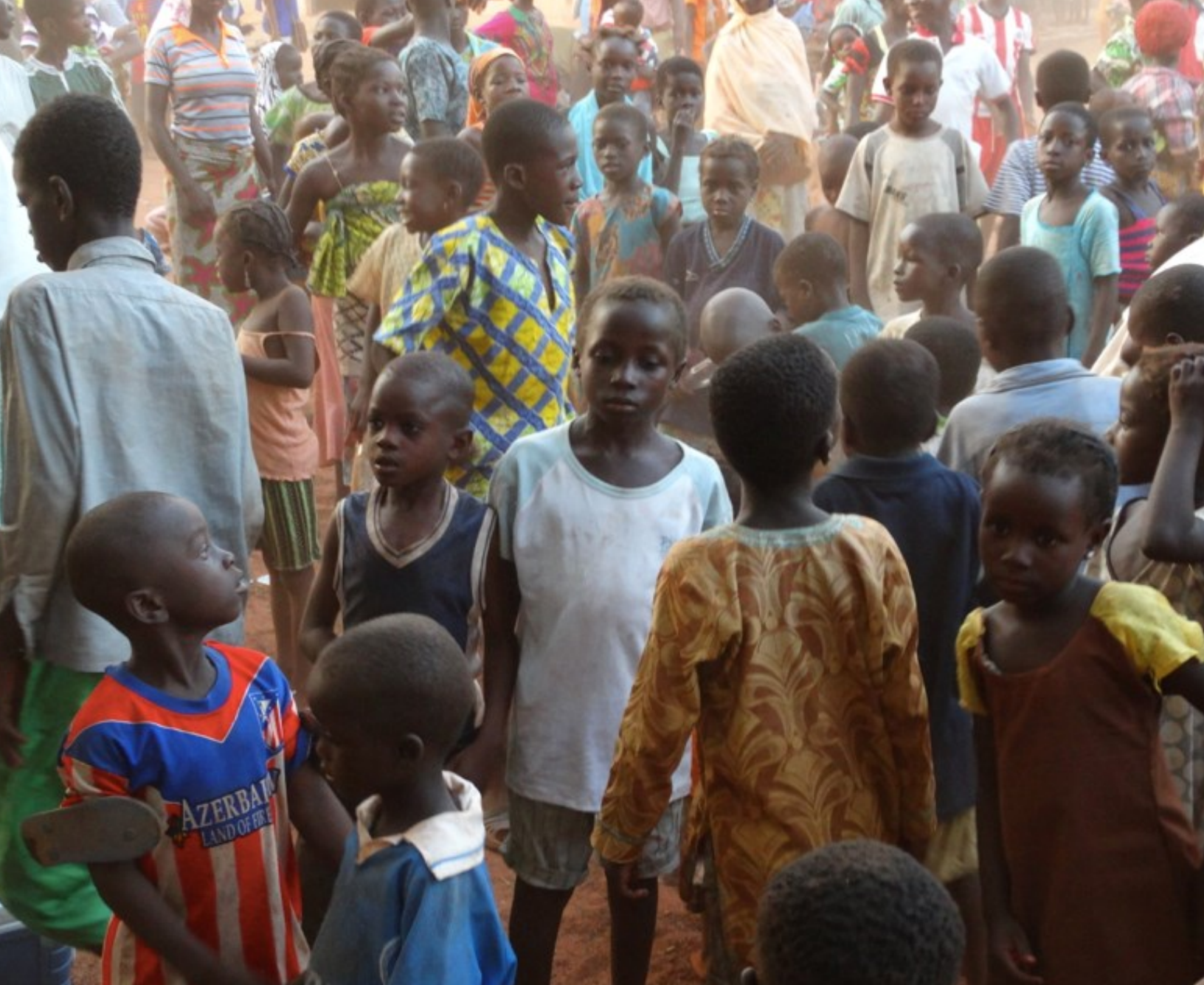
Village in Northern Region, Ghana before public health musical event in December, 2014

Planetary Health Weekly is an e-newsletter published by the Planetary Health Commission at Ryerson University in Toronto, ON, CANADA. To Subscribe/Unsubscribe, email planetaryhealthweekly@gmail.com