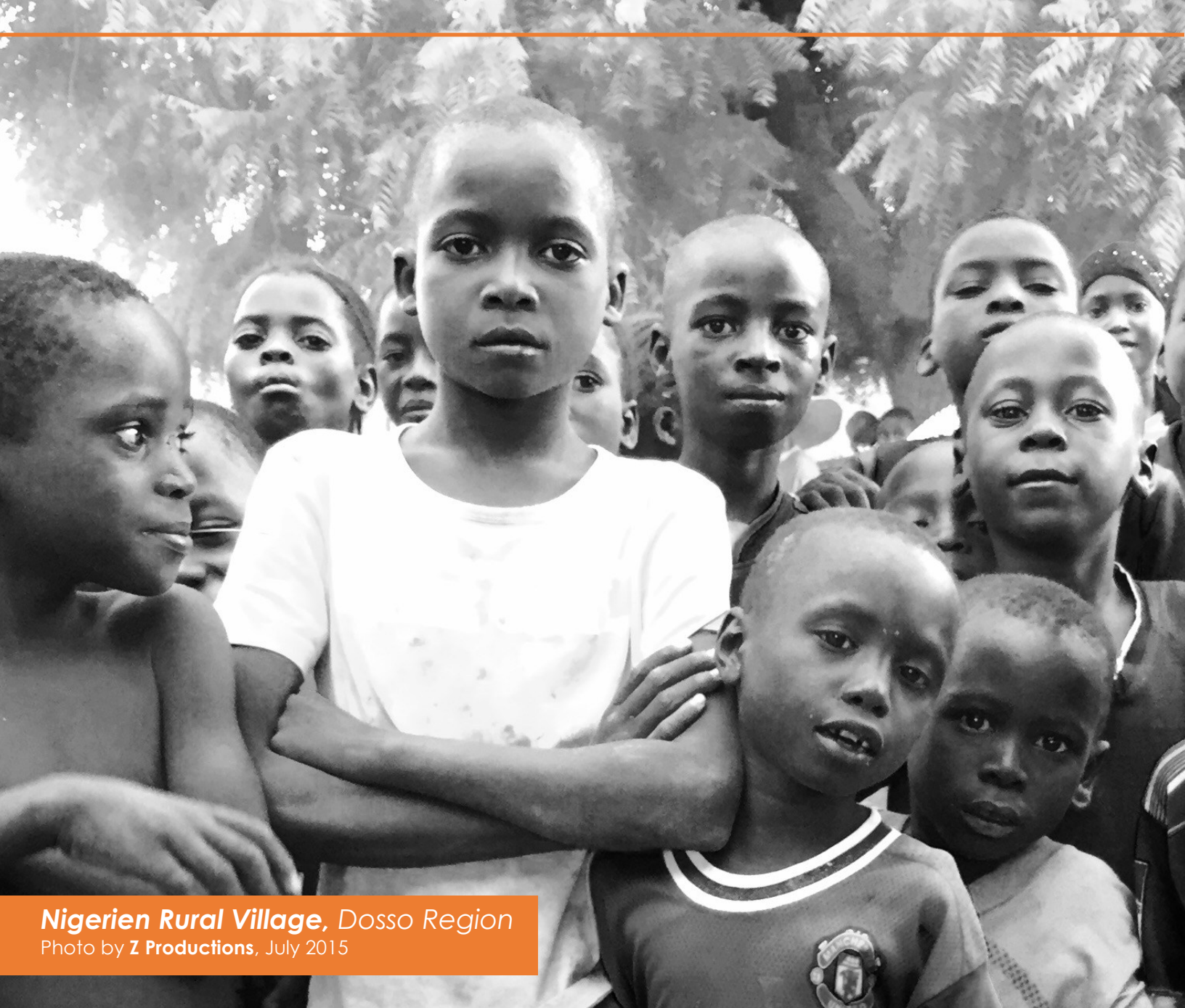
Nigerien Rural Village, Dosso Region, July 2015

This Newsletter is FREE. Planetary Health Weekly is an e-newsletter published by the Planetary Health Commission at Ryerson University in Toronto, ON, CANADA. To Subscribe / Unsubscribe, email planetaryhealthweekly@gmail.com .