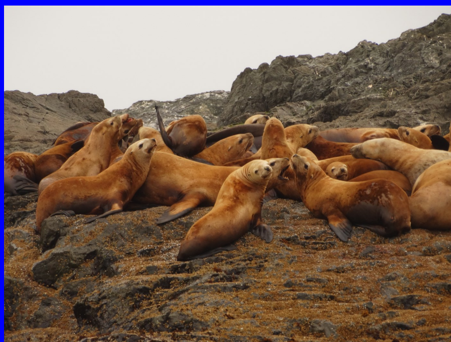
The wonders of Vancouver Island (near Tofino)